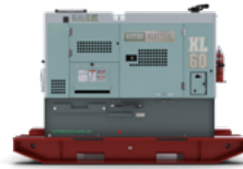
XL AND WH