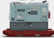
XL AND WH