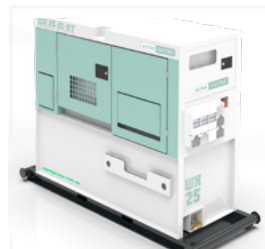
WHISPER BIG TANK