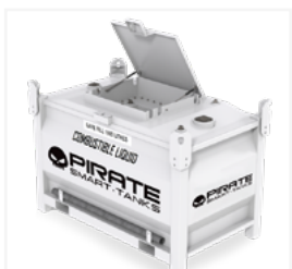
LIFT & SHIFT