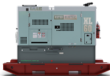
XL AND WH