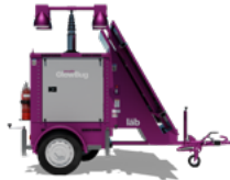
Hydrogen Light tower