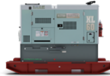
XL AND WH