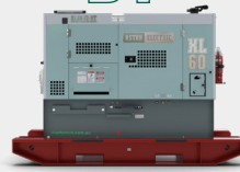
XL AND WH