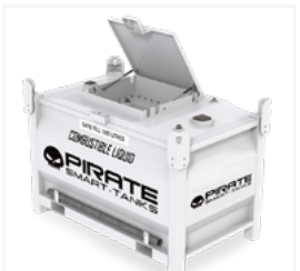
LIFT & SHIFT