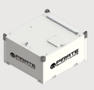
L S 6