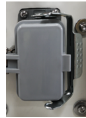
ATS Connector Port