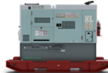
XL AND WH