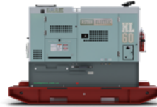
XL AND WH