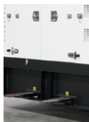
Fork Pocket Skid