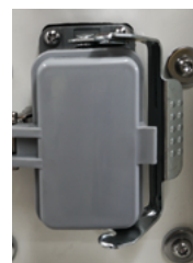
ATS Connector Port