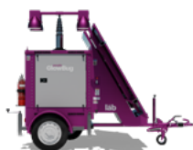
Hydrogen Light tower