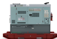
XL AND WH