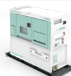
WHISPER BIG TANK