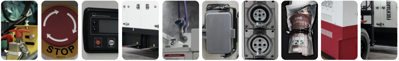
Battery Isolator E - Stop DSE Controller Fork Skid Center Lift ATS Connector Outlets Kit Fire Extinguisher 24 Hr tank Bunded