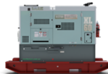
XL AND WH