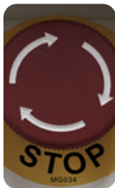
E - Stop