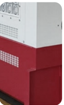
24 Hr tank