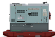
XL AND WH