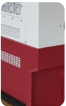
24 Hr tank