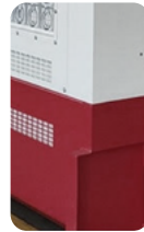
24 Hr tank