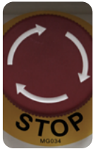
E - Stop