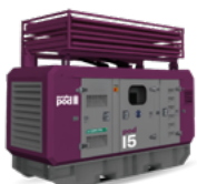
SOLAR GEN HYBRID