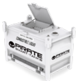
LIFT & SHIFT