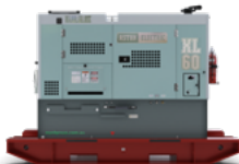
XL AND WH